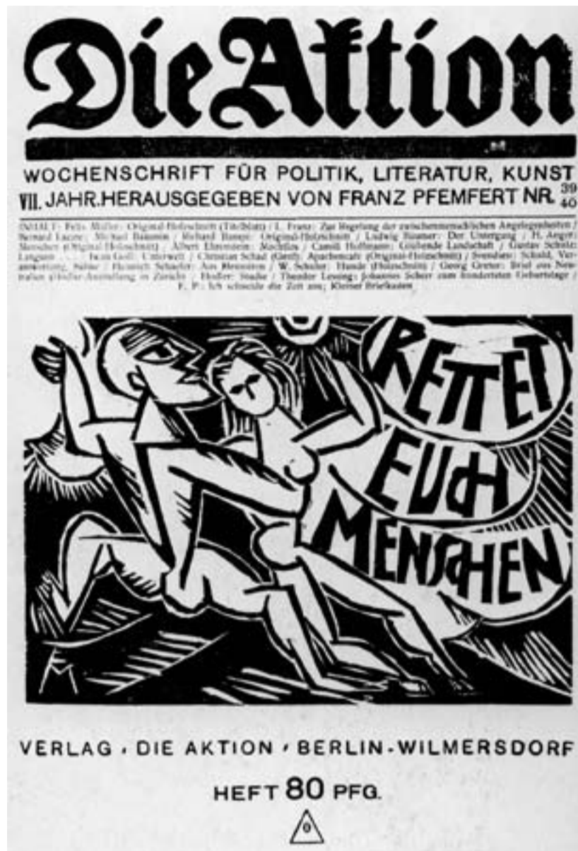
Die Aktion Vol. VII, nos 39–40 (1917). Title Page: Woodcut by Conrad Felixmüller: Rettet Euch Menschen

oppositional activities targeting the G8 summit in Genoa in July 2001, and then the group's work with the activist gathering at the Strasbourg noborder camp of 2002. These are the most recent episodes addressed, but far from marking the closing of a period, they stand as keeping the long twentieth century open and present. It is not only that by any measure four years before the date of publication counts as recent history, well within the scope of personal memory and still-rough primary accounts. More significant is that Raunig tells of the PublixTheatreCaravan's activity following the events of Genoa, infamous for the brutality of the police actions, and of how the group evolved in a changed political climate. The post-Genoa climate is essentially continuous with the post-9/11 repressive media-saturated regime we in North America and Europe experience today, sometimes violently, especially depending on skin color and relative wealth. We cannot exist apart from, outside of, or beyond the long twentieth century of art and revolution, Raunig seems to be saying. We are in it, looking for ways to continue the task before us, laid out in imaginary terms by Chernyshevsky nearly a decade before Courbet served as Commune Councilor. In other words: What is to be done?