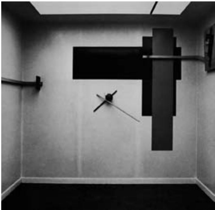
▲ El Lissitzky, Prounenraum (1923) at the Grosse Berliner Kunstausstellung; reconstruction from Eindhoven, Stedelijk van Abbemuseum, 1965.