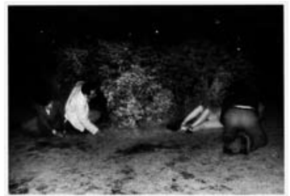
4 Left to right: Kohei Yoshiyuki, Untitled , 1979, Untitled , 1971, Untitled , 1971. From the series The Park . Courtesy Yossi Milo Gallery. Copyright Kohei Yoshiyuki.