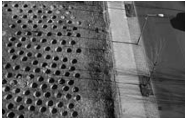
▶ Kilian Rütthemann, Stripping , 2008. Installation view of the 5th Berlin Biennial for Contemporary Art at Skulpturenpark Berlin Zentrum. 300 pits, diameter each 80 cm.