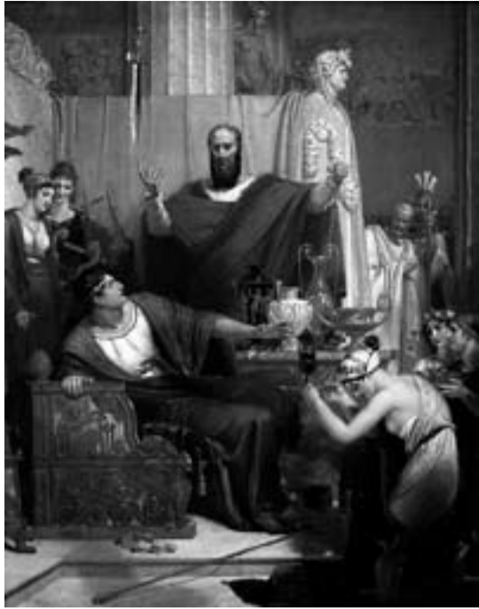
Richard Westall, The Sword of Damocles , 1812. Ackland Art Museum.

anthropologies that variously parade as a critical philosophy liberated from the constraints of the a priori, as a new form ontology, as the foundation of the human sciences, etc. This is in fact an anthropological mirror image of the transcendental illusion once dispelled by Kant, and into which Foucault seems to include most modern reflections on finitude, from Husserl to Heidegger and Merleau-Ponty, as comes across in his dense and allusive description: This illusion “became the truth of truth—that on the basis of which truth is always there and never given; it thus became the raison d’être and the source of critique; the point of origin of that movement whereby man loses the truth and ceaselessly finds himself summoned back to it. Defined today as finitude, this illusion became in the highest sense the withdrawal of truth: that in which it hides itself, and in which one can always find it” (77).