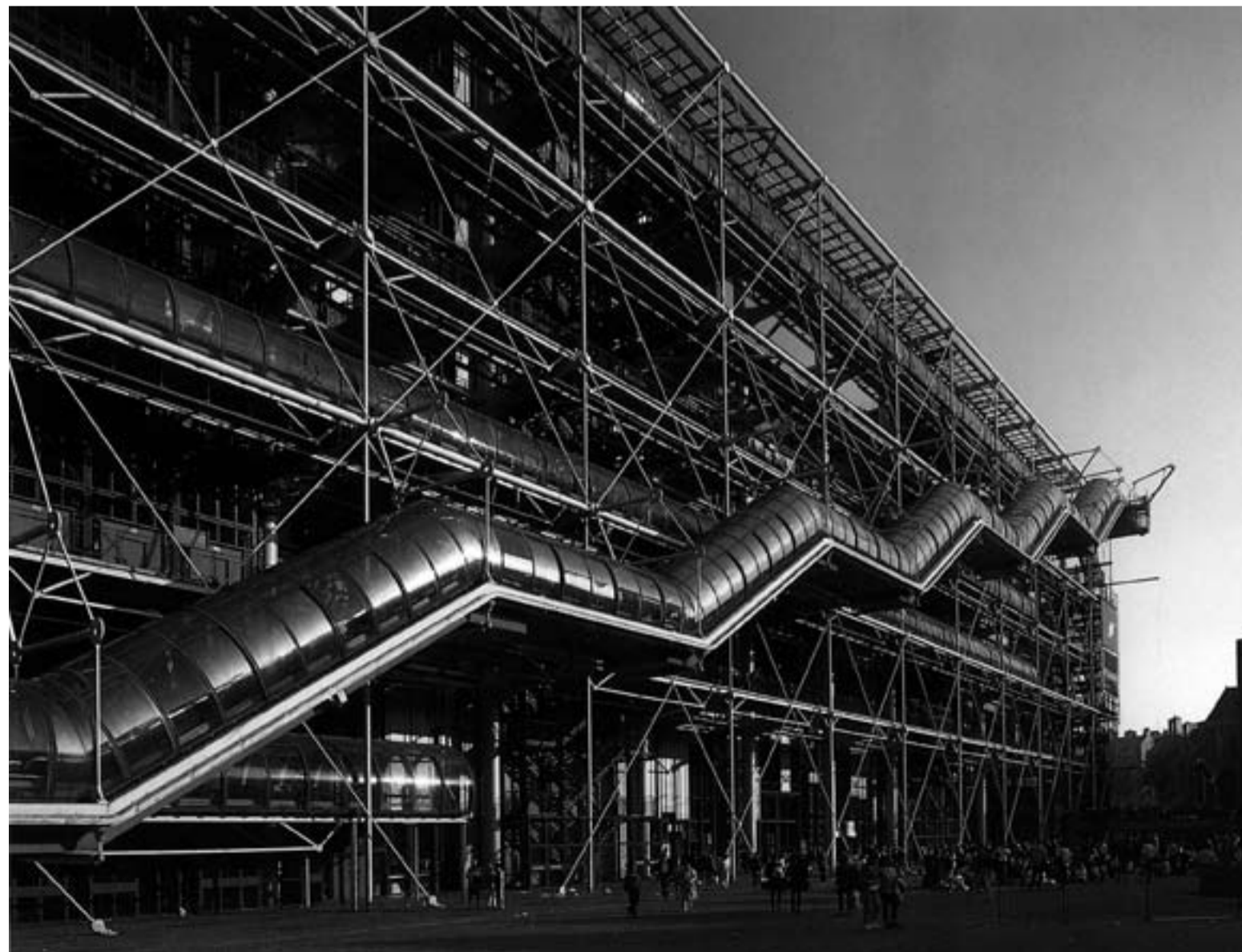
4 Renzo Piano and Richard Rogers Centre Pompidou, Paris, 1971–1977