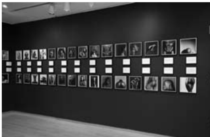
↑ Glenn Ligon, Notes on the Margin of the Black Book, 1991–1993 .