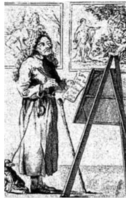
► Claude-Henri Watelet, La Font de Saint-Yenne , etching after design by Portien.