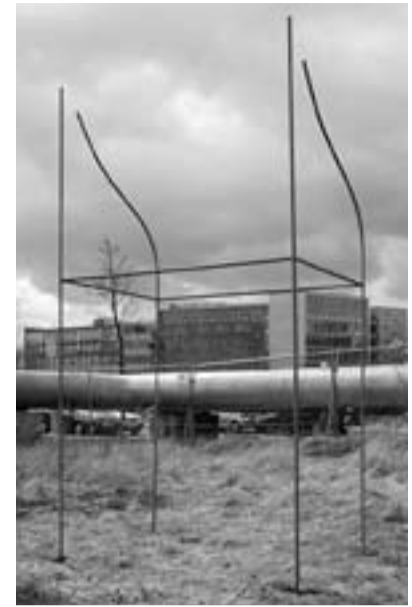
▲ Aleana Egan, Grey luminous light from the sea (A Structure for Readings) , 2008. Installation view of the 5th Berlin Biennial for Contemporary Art at Skulpturenpark Berlin Zentrum.