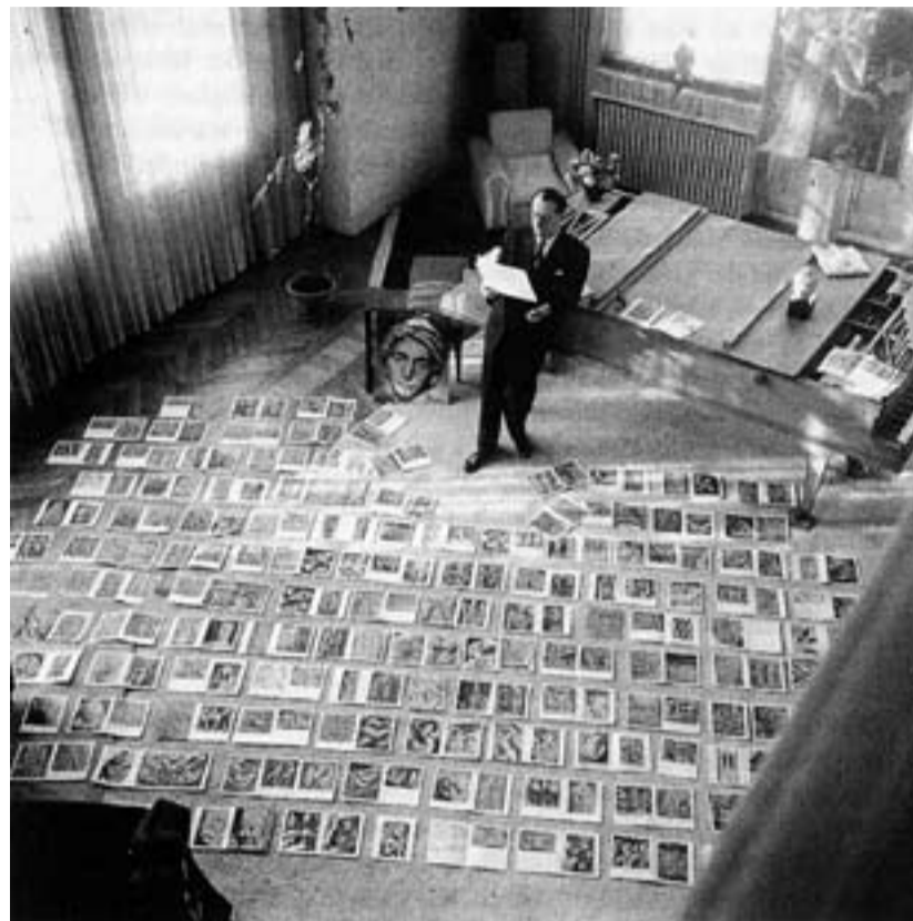
▼ André Malraux in front of images for Le Musée imaginaire , ca. 1950

to consume culture rather than to reflect on it. However, the Pompidou is an example of the changing of a museum's identity through architecture and creating an exhibition and museum typology that, rather than being geared towards representation and representative spaces, intends to resemble a laboratory directed towards experimentation.