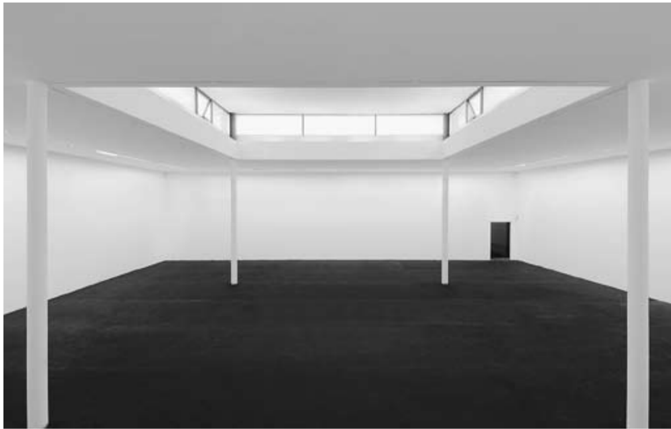
▲ Ahmet Ögüt, Ground Control , 2007/2008. Installation view of the 5th Berlin Biennial for Contemporary Art at KW Institute for Contemporary Art. Courtesy Ahmet Ögüt; RODEO, Istanbul. Copyright Berlin Biennial for Contemporary Art, Uwe Walter, 2008.

PAGE 22 Postcards from New York By Karl Lydén