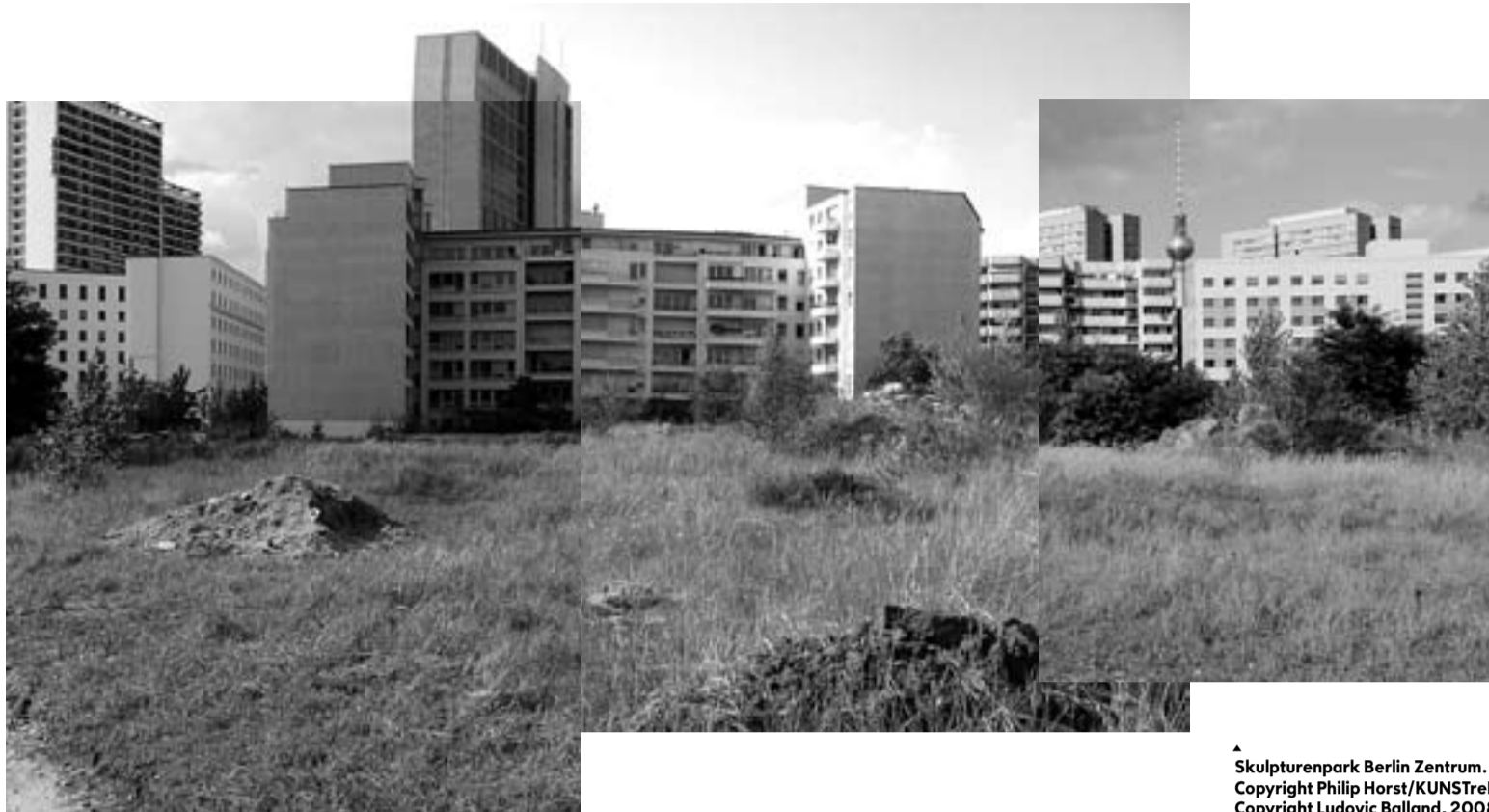
▲ Skulpturenpark Berlin Zentrum.