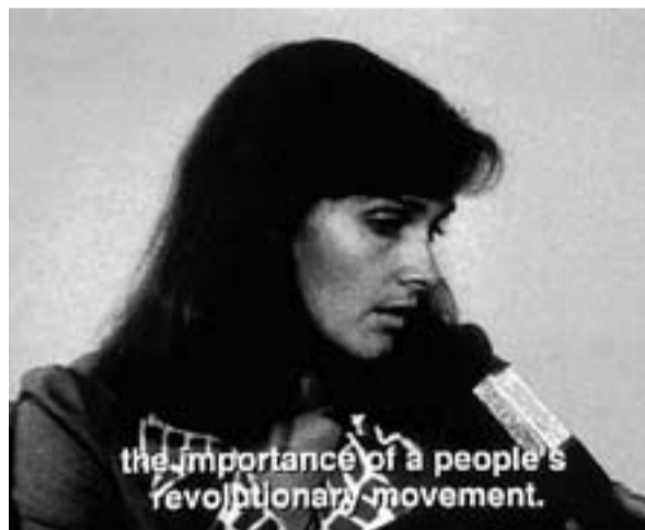
◄ Anri Sala, Intervista , 1998.

site, you find something of an analogy of the whole exhibition. It is blue, round and big, but it is only four words that monumentally and somewhat hollowly read “New Art, New Ideas”.