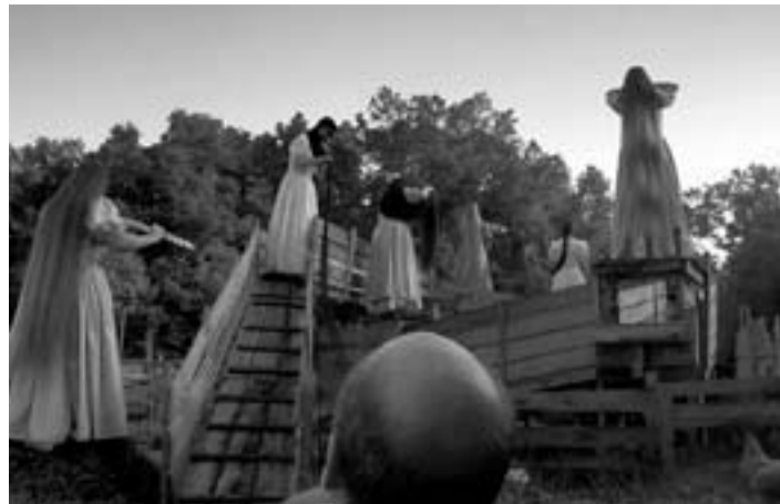
▶ Mika Rottenberg, Production still from Cheese , 2007. Digital video, color, sound; approximately 12 min. Collection of the artist.