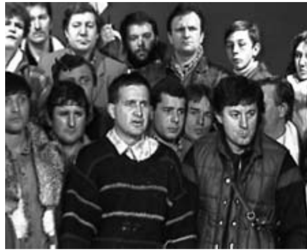
▲ Harun Farocki and Andrei Ujica, Videograms of a Revolution , 1993.